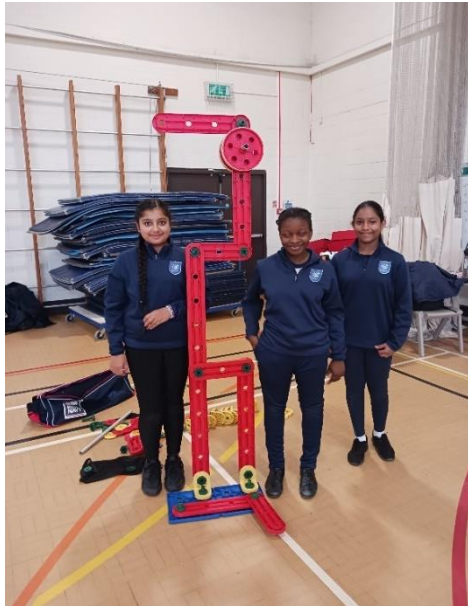
One of the winning groups