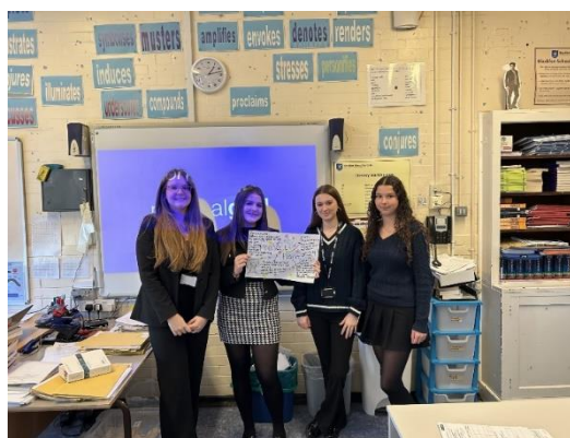
Group presentation winners

Our Year12/13 students found this workshop to be informative, beneficial and gave them a better understanding of careers in this industry.