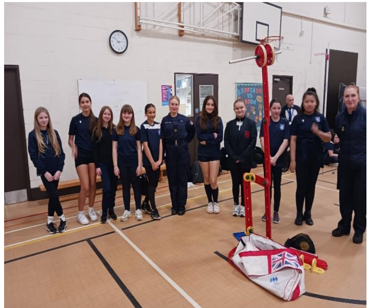
Best Teamwork and Best Build