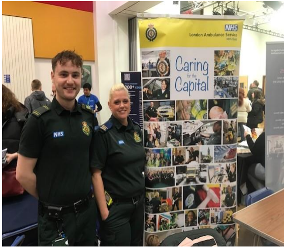
London Ambulance Service