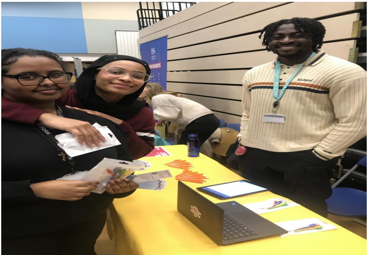
London South Bank University