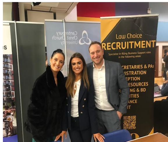
Law Choice Recruitment