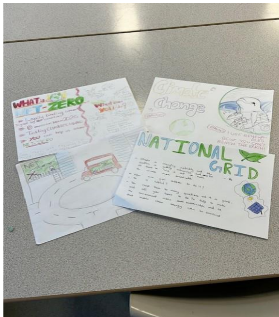
Group presentation posters

Our Year 9 students found this workshop to be informative, beneficial and gave them a better understanding of careers in this industry.